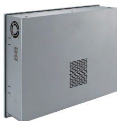
▲ Back view