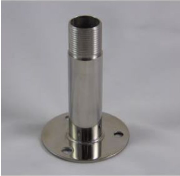
6535S Universal mount stainless steel. Standard thread 1" x 14, weight 300 grams. Height 100 mm. (4")