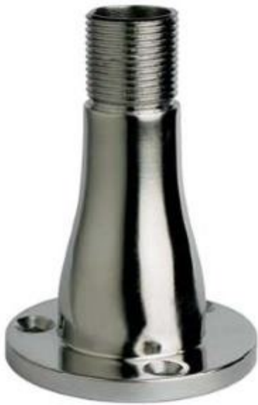
V9174 Universal mount stainless steel. Standard thread 1" x 14, weight 280 grams. Height 100 mm. (4"). Electropolished.