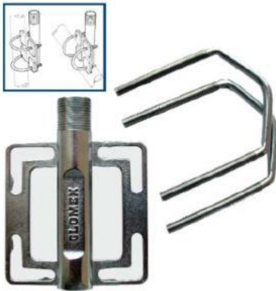
V9171 Pipe mounting bracket in stainless steel, thread 1"x14. For horizontal and vertical mount. Weight 600 gr. For tubes diam. 25-80 mm. Electropolished.