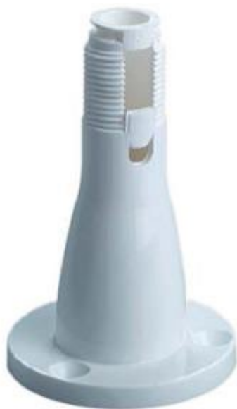
V9175 Universal mount reinforced nylon. Standard thread 1" x 14, weight 50 grams. Height 100 mm. (4")